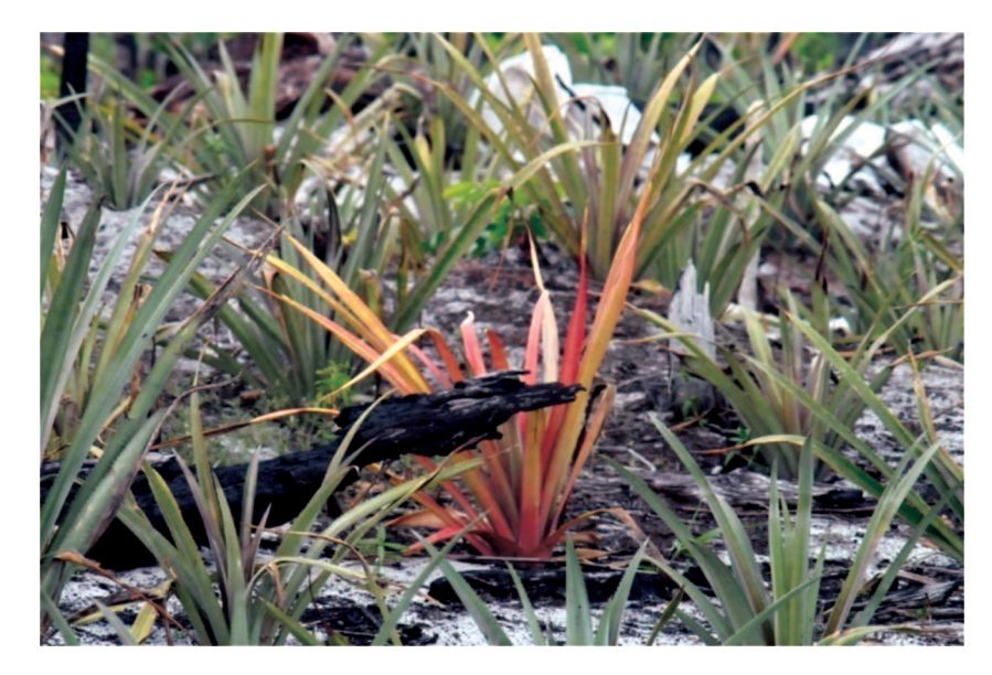
Figure 1: 'Scarlet Tip' (Stage 1)