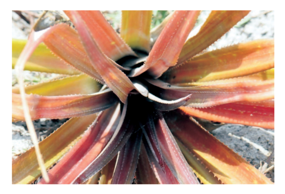
Figure 2: 'Scarlet Tip' (Stage 2)