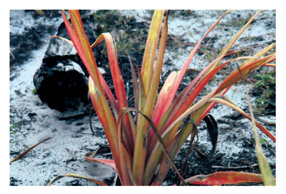
Figure 4: 'Scarlet Tip' (Stage 4)

National Agricultural Research Institute