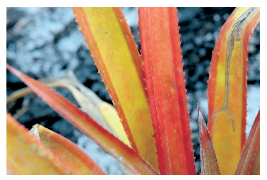
Figure 3: 'Scarlet Tip' (Stage 3)