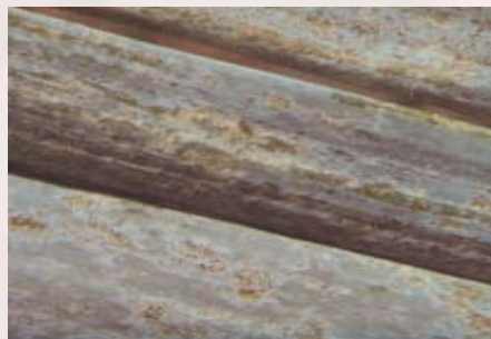
Fig 9. Adult thrips and damage caused.

Thrips are yellow, tiny, elongated insects about 1mm in length and can be found on the upper and lower surfaces of leaves (Figure 9). Infestations are more severe in the dry season. Both young and adult suck the sap from leaves and cause them to lose their colour (Figure 9). If attack occurs early the young leaves become distorted. Older tissues become blotched and appear silvery or leathery in affected areas, thus hindering photosynthesis. Flowers and fruits are also affected, thus yields are reduced. Infected fruits are discoloured, distorted and hardened. Thrips are also vectors or major viral diseases. The lifecycle may be completed in about 14-21 days.