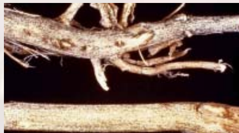
Fig 17. Symptoms of root knot

The nematodes stimulate the formation of root galls (Figure 17), which interfere with the plant's water supply, resulting in stunted and chlorotic growth, poor fruit setting and yellowing. The females lay several hundred eggs which are released into the soil. They enter the plant tissues, such as the root tips and stimulate the formation of galls.