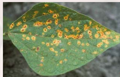
Fig 16. Symptoms of rust

Small reddish-brown pustules form on the lower side of leaves (Figure 16). The fungus lives in crop residue.