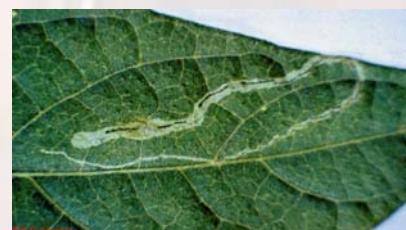
Fig 5. Damage due to leaf miner

These are very tiny maggots which tunnel between the inner and outer surfaces of the leaves. Damage is done by their feeding habits which leave irregular trails on the leaves (Figure 5).