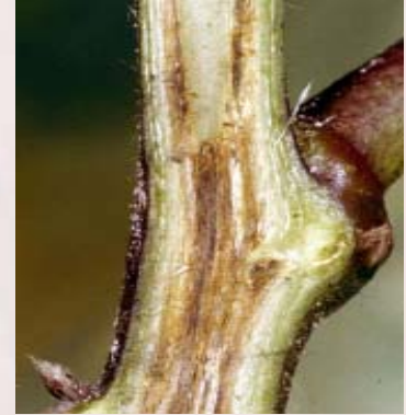
Fig 18. Symptoms fusarium wilt

The vascular system is infected, toxins are produced and the xylem turns brown (Figure 18). Seedlings may rot, leaves turn yellow and wilt. Plants may eventually die.