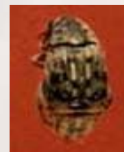
Fig 4. Bean Beetle

Sometimes, it damages flowers and pods, while serious damage can be caused on young plants. It is also a vector for the mosaic viruses.