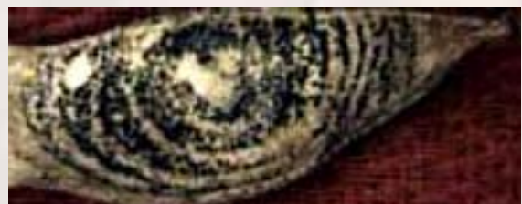
Fig 15. Symptoms of pod blight

Symptoms Pod blight of cowpea is first observed as brown pustules of irregular shape on the leaves. Lesions grow to one-fourth to three-fourths of an inch in diameter. During the latter part of the growing season, the fungus spreads to nearby pods, where it causes a pale watery spot. The spot enlarges and becomes darker with age. On pods the spot is marked by dark brown to black pustules on the surface arranged in a ring (Figure 15).