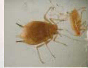
Fig 3. Aphids

They cause the leaves to curl and turn downwards. Growth of the plant is seriously affected as a result.