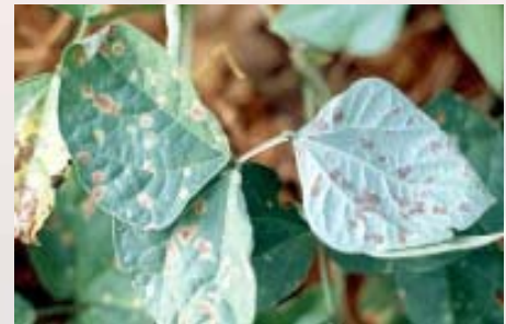
Fig 19. Symptoms of anthracnose

This is a seed-borne fungus which attacks all above ground portions of the plant. Infected seed are marked by dark, sunken lesions that extend through the seed coat. Stem lesions are oval and sunken. The center of the lesion is dark brown with purplish to red borders. In early stages, the fungus develops along the veins and becomes purplish to red in color. In advanced stages, leaves become ragged (Figure 19). Infection of the pods results in small, reddish, elongated spots. Older spots are sunken and have brown to reddish-brown borders.