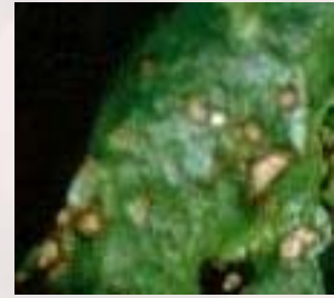
Fig 13 Cercospora leaf spot symptoms

Fungicide sprays should begin at first sign of disease.