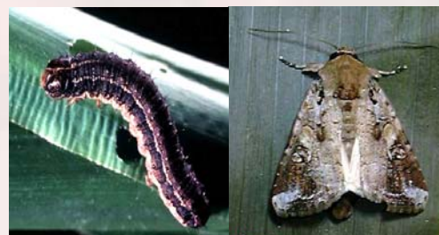
Fig 6. Larva and adult of leaf eating caterpillars

Several species of caterpillars (Figure 6) feed on leaves of the cowpea plant. Yields can be seriously reduced if there is severe defoliation.