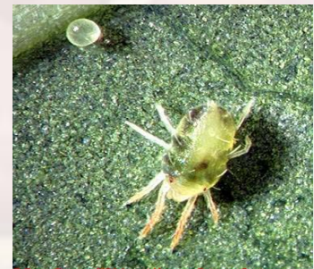
Fig 3. Mite

Continuous feeding causes the leaves to turn rust-brown in colour and later they become covered by webbing.