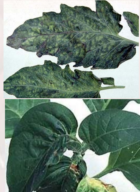
Fig 20. symptoms of Viral disease