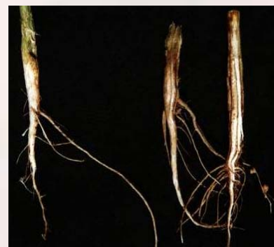
Fig 14. Symptoms of root rot