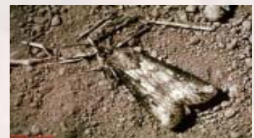
Fig 2. Larva and adult of the cutworm