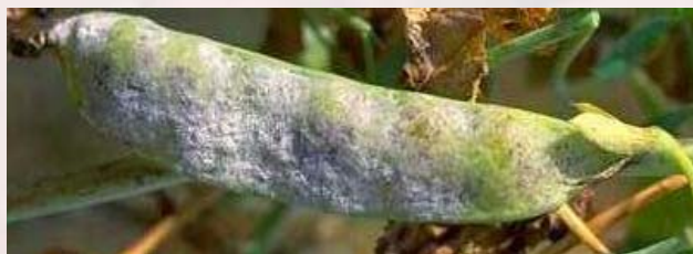
Fig 11. Symptoms of powdery mildew

This is one of the most common diseases of cowpea in the humid tropics. This disease can be serious depending on the age of the plant.