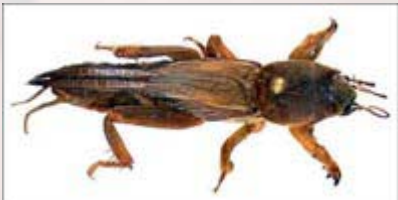
Fig 1. Adult cricket

Crickets (Figure 1) usually cut the primary leaves or growing points of the plant while the larvae of the cutworm (Figure 2), which can be found at the base of the plant and a few meters deep in the soil, cut young seedlings at ground level.