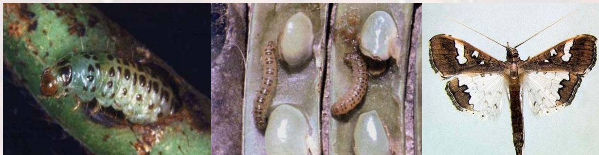
Fig 7 Larva and adult pod borer

The eggs are laid individually or in small batches on flowers or flower buds, sometimes partly covered with scales, and also on terminal shoots of young plants. The egg period lasts an average of 3 days. Several first-instar larvae (Figure 7) may be found together among flowers, thereafter they disperse singly, moving from one flower to another so that each larva damages 4-6 flowers. Young larvae may feed on any part of the flower or foliage, but later-instar larvae are more common in the pods. The pupal stage lasts an average of 6-7 days. Adults are inactive during the day and can be found at rest with outspread wings under the lower leaves of the host plant. They live for an average of 6-10 days (Figure 7).