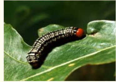
Fig.1 Leaf Feeding Caterpillar

When used correctly, chemical insecticides can prevent insect damage and increase yield.