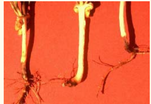
Fig 7. Seedling diseases

Seedling organisms include Rhizoctonia , Fusarium , Aspergillus niger and Pythium . Infection usually occurs within 24 to 48 hours after planting under adverse planting conditions (excessive moisture, excessive heat and drought). Seedling diseases are best characterized as poor stands. These soil-borne organisms can attack seeds and cause a decrease in germination. Seeds can be covered in masses of black spores, appear reddish brown, water-soaked depending on the fungus responsible. These fungi also cause pre-emergent soft rot of the hypocotyls but the most common cause of loss from these pathogens is early post-emergence seedling blight. Young plants collapse and die soon after emergence due to rot of succulent elongating hypocotyls (Figure 7) .