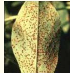
Fig 8. Peanut rust

The orange-coloured pustules develop on all aboveground plant parts except flowers and pegs. The spores appear first on the lower leaf surfaces. Rust-damaged leaves often remain attached to the plant (Figure 8).