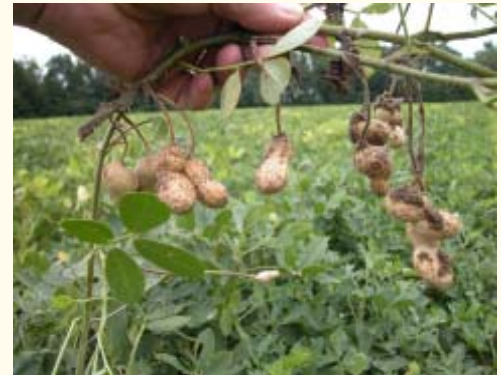
Fig 10. Peanut leaves and freshly dug pods

Peanuts generally mature within 90-120 days depending on the variety.