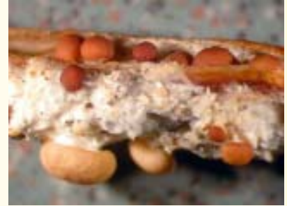
Fig 6. Mycelium of the southern blight fungus at the base of an infected plant.

The first readily apparent symptoms of southern blight are rapid yellowing and wilting of limbs or entire plants. Affected limbs and plants then turn brown and die as a result of the decay of the lower stem (Figure 6). Southern blight infection is characterized by white or cream coloured moldy growth (mycelium) covering lower stems and imparting a whitewashed appearance to the base of the affected plants.