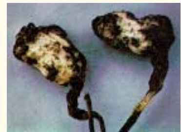
Fig 4. Peanut Root-Knot Nematode

Root-knot nematodes exist in the soil in the form of eggs or larvae (Figure 4). Larvae begin feeding on the root tissue, which causes plant cells to increase in size and number. After 20-30 days, the larvae swell into large females. The female produces about 200 to 1500 eggs in a gelatinous matrix.