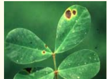
Fig. 5 Early leaf spot

Both early and late leaf spot cause drastic and direct damages, resulting in reduced photosynthesis (Figure 5). Both types of leaf spots can appear as early as 40 days after planting, but can be earlier depending on the suitability of environmental conditions for spore germination. In both cases, the fungus can girdle pegs, and necrotic leaflets falling on soil surface promote soil borne diseases. Early leaf spot lesion is usually tan to brown or reddish-brown and is often surrounded by a yellow halo. Late leaf spot lesions are darker, often nearly black, with little or no halo.