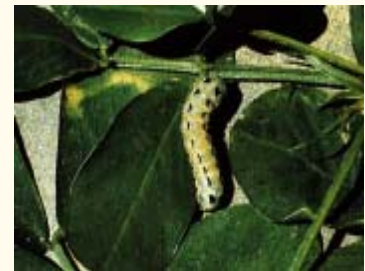
Fig.3 Stalk Borer

Outbreak of stalk borer in sandy soils usually occurs during hot, dry weather. The stalk borer feeds on underground pegs and pods; larvae tunnel into any aboveground part of the plant that is in contact with the surface of the soil (Figure 3). During the early stages of plant development, tunneling into the hypocotyls will stunt, and some times kill, young plants. Fields should be scouted at weekly intervals for the stalk borer.