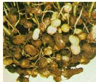
Fig. 9. Pod Rot

As peanuts approach maturity and plants are pulled up to make maturity assessments, rotten pods may be noticed. This is a disease commonly called pod rot, but it is a complex problem involving soil fungi, nutrition (calcium deficiency and/or out of balance calcium/potassium ratio) and probably other factors. Pod rot is the only visible symptom when this disease occurs.